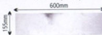
STEP TILE (Riser)

Tile Area : 1.96 sqft. & 0.98 sqft. Tiles per Box : 2 pcs & 4 pcs Box Area : 3.92 sqft.z & 3.92 sqft.