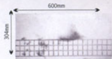
STEP TILE (Thread)